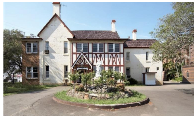
The Presbytery c 2003

When Father McCarthy was appointed parish priest in 1870, he lived in a cottage on the Burwood side of Parramatta Road until the Presbytery (the priest's residence) was built in 1882. It stood on the northern side of the 1874 church facing Burton Street.