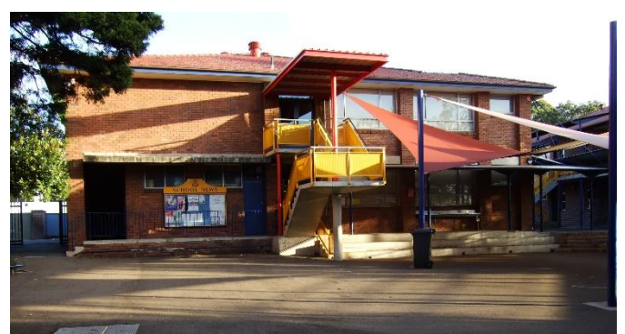
The 1972 classroom block was then demolished to create the present "grass" area.

St Mary's School continued to expand. In 1940 a new infants' school was built facing Burton Street and in 1956 a Commercial College for girls was built on the site of the second church. When more classrooms were needed in the 1970s, the first school building was demolished to make way for a new block of classrooms that were blessed and opened by Archbishop James Freeman on 3 September 1972. They became the Kindergarten block until almost forty years later in 2011 when another classroom block was built for Kindergarten along the Parramatta Road boundary of the school precinct on the western side of the hall.