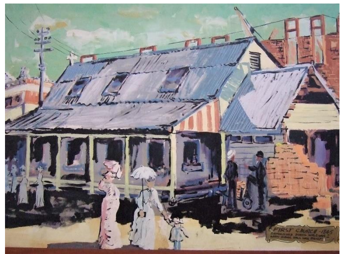
The First Church 1845

The Concord-Burwood district continued to grow and in 1844 land was purchased by the Catholic Church on Parramatta Road at Concord for the site of a church and school.