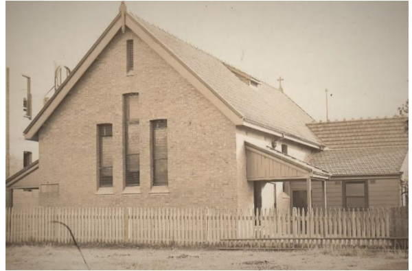
The photo of the 1894 school was taken 1917 as the hall was under construction (on the left).