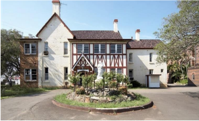
The Presbytery c 2003

When Father McCarthy was appointed parish priest in 1870, he lived in a cottage on the Burwood side of Parramatta Road until the Presbytery (the priest's residence) was built in 1882. It stood on the northern side of the 1874 church facing Burton Street.