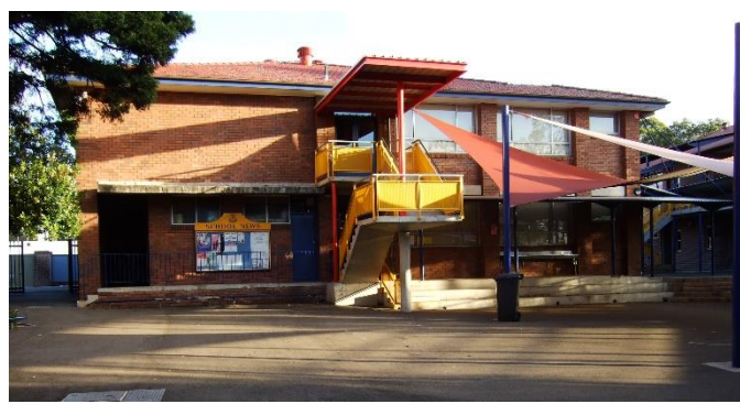
The 1972 classroom block was then demolished to create the present "grass" area.

1956 a Commercial College for girls was built on the site of the second church. When more classrooms were needed in the 1970s, the first school building was demolished to make way for a new block of classrooms that were blessed and opened by Archbishop James Freeman on 3 September 1972. They became the Kindergarten block until almost forty years later in 2011 when another classroom block was built for Kindergarten along the Parramatta Road boundary of the school precinct on the western side of the hall.