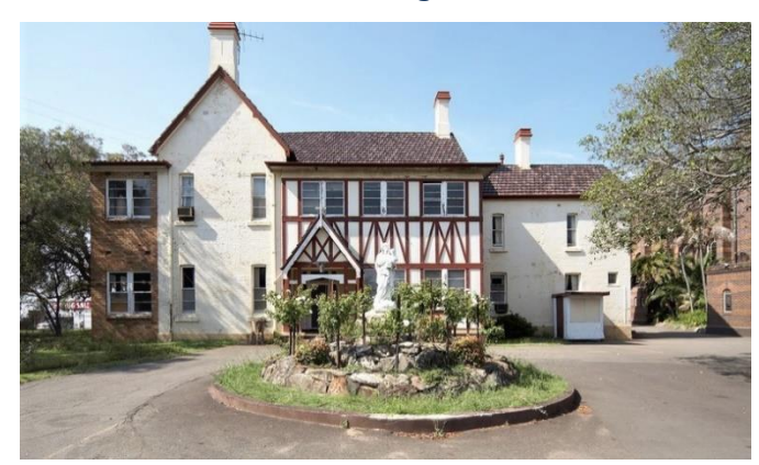
The Presbytery c 2003

When Father McCarthy was appointed parish priest in 1870, he lived in a cottage on the Burwood side of Parramatta Road until the Presbytery (the priest's residence) was built in 1882. It stood on the northern side of the 1874 church facing Burton Street.