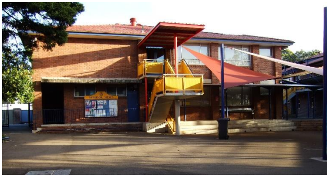
The 1972 classroom block was then demolished to create the present "grass" area.

St Mary's School continued to expand. In 1940 a new infants' school was built facing Burton Street and in 1956 a Commercial College for girls was built on the site of the second church. When more classrooms were needed in the 1970s, the first school building was demolished to make way for a new block of classrooms that were blessed and opened by Archbishop James Freeman on 3 September 1972. They became the Kindergarten block until almost forty years later in 2011 when another classroom block was built for Kindergarten along the Parramatta Road boundary of the school precinct on the western side of the hall.