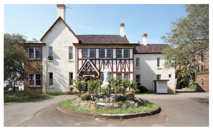
The Presbytery c 2003

When Father McCarthy was appointed parish priest in 1870, he lived in a cottage on the Burwood side of Parramatta Road until the Presbytery (the priest's residence) was built in 1882. It stood on the northern side of the 1874 church facing Burton Street.