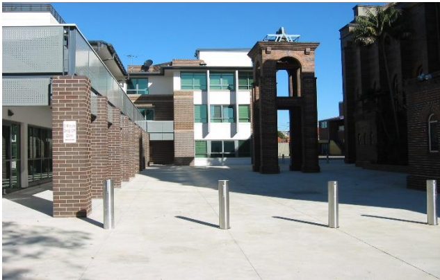
St Mary's Villa Residential Aged Care 2010

In 2008, as part of the strategic plan for the development of the parish site, the Presbytery, the Convent and the 1950s school building were all demolished to make way for the new St Mary's Villa.