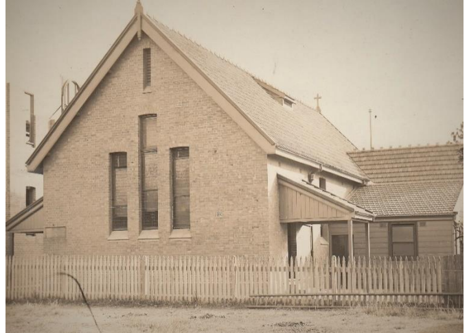
The photo of the 1894 school was taken 1917 as the hall was under construction (on the left).