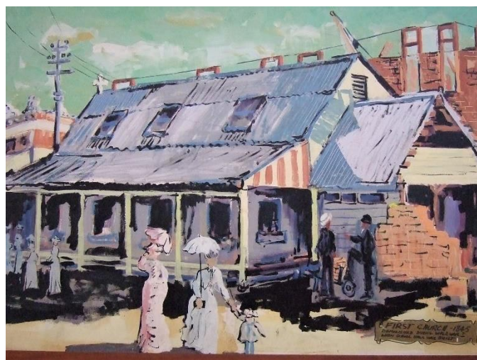
The First Church 1845

The Concord-Burwood district continued to grow and in 1844 land was purchased by the Catholic Church on Parramatta Road at Concord for the site of a church and school.