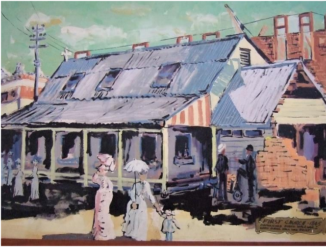
The First Church 1845

Parramatta Road at Concord for the site of a church and school.