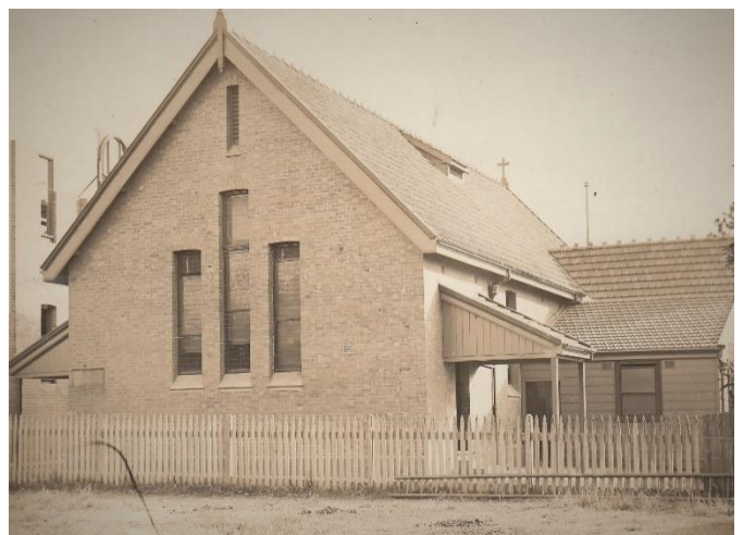
The photo of the 1894 school was taken 1917 as the hall was under construction (on the left).