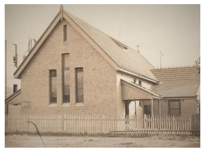
The photo of the 1894 school was taken 1917 as the hall was under construction (on the left).

in 1883 the Sisters began travelling each day from Ashfield to teach in the school-hall