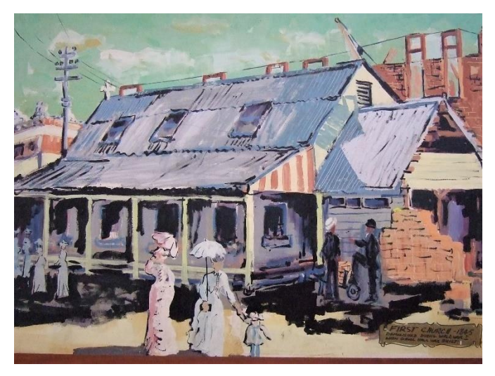
The First Church 1845

The Concord-Burwood district continued to grow and in 1844 land was purchased by the Catholic Church on Parramatta Road at Concord for the site of a church and school.