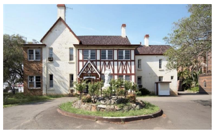
The Presbytery c 2003

When Father McCarthy was appointed parish priest in 1870, he lived in a cottage on the Burwood side of Parramatta Road until the Presbytery (the priest's residence) was built in 1882. It stood on the northern side of the 1874 church facing Burton Street.