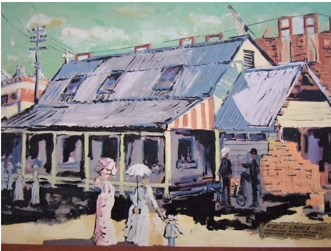
The First Church 1845

The Concord-Burwood district continued to grow and in 1844 land was purchased by the Catholic Church on Parramatta Road at Concord for the site of a church and school.