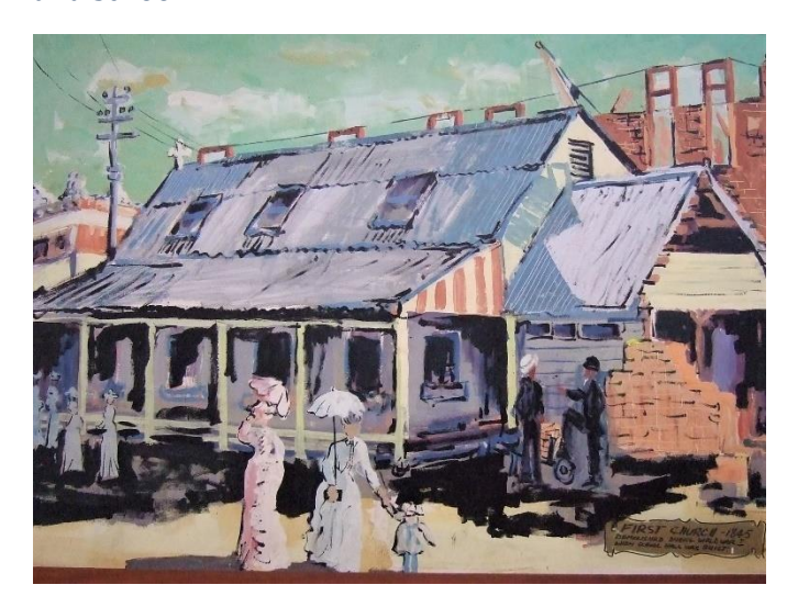
The First Church 1845

The Concord-Burwood district continued to grow and in 1844 land was purchased by the Catholic Church on Parramatta Road at Concord for the site of a church and school.