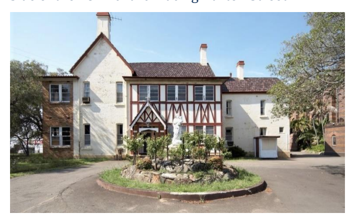
The Presbytery c 2003

When Father McCarthy was appointed parish priest in 1870, he lived in a cottage on the Burwood side of Parramatta Road until the Presbytery (the priest's residence) was built in 1882. It stood on the northern side of the 1874 church facing Burton Street.