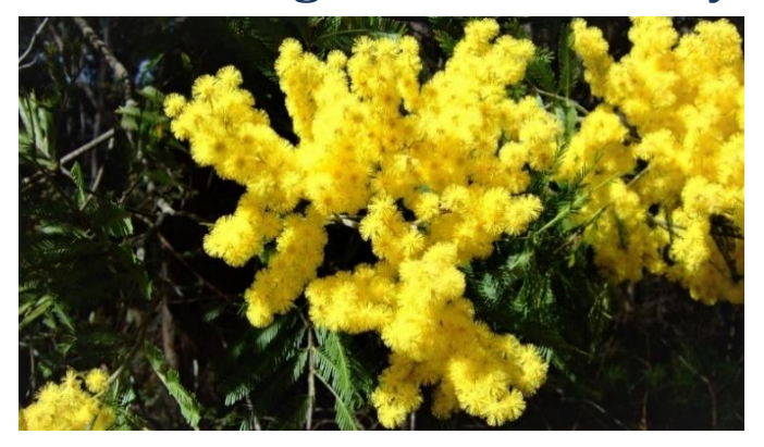
We acknowledge the Wangal people of the Eora nation as the traditional custodians of this land.