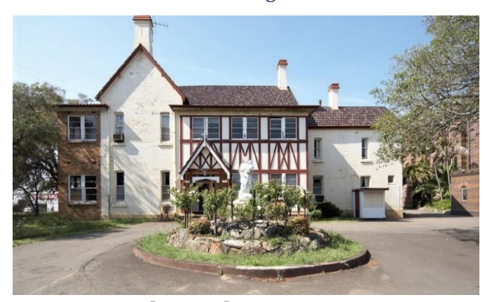
The Presbytery c 2003

When Father McCarthy was appointed parish priest in 1870, he lived in a cottage on the Burwood side of Parramatta Road until the Presbytery (the priest's residence) was built in 1882. It stood on the northern side of the 1874 church facing Burton Street.