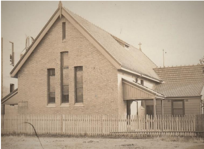
The photo of the 1894 school was taken 1917 as the hall was under construction (on the left).