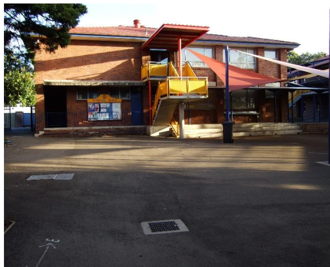
The 1972 block after the 2000-2001 renovations.