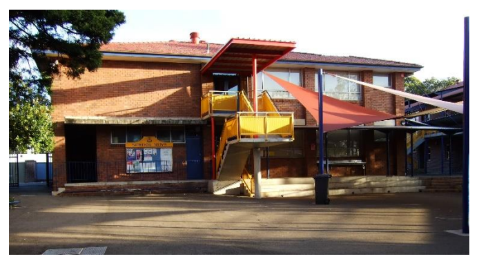
The 1972 classrooms was then demolished to create the present "grass" area.

St Mary's School continued to expand. In 1940 a new infants' school was built facing Burton Street and in 1956 a Commercial College for girls was built on the site of the second church. When more classrooms were needed in the 1970s, the first school building was demolished to make way for a new block of classrooms that were blessed and opened by Archbishop James Freeman on 3 September 1972. They became the Kindergarten block until almost forty years later in 2011 when another classroom block was built for Kindergarten along the Parramatta Road boundary of the school precinct on the western side of the hall.