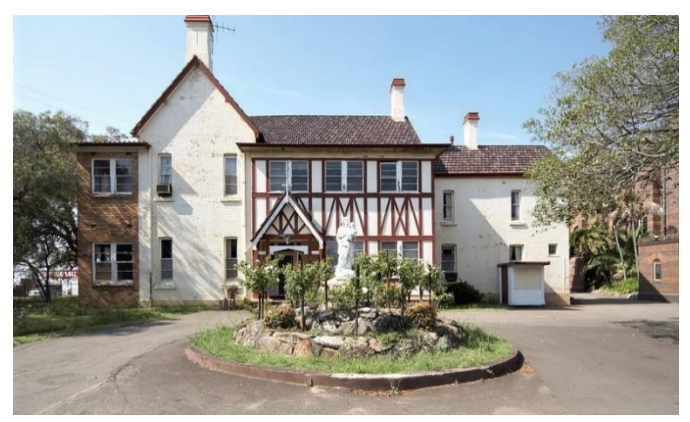
The Presbytery c 2003

When Father McCarthy was appointed parish priest in 1870, he lived in a cottage on the Burwood side of Parramatta Road until the Presbytery (the priest's residence) was built in 1882. It stood on the northern side of the 1874 church facing Burton Street.