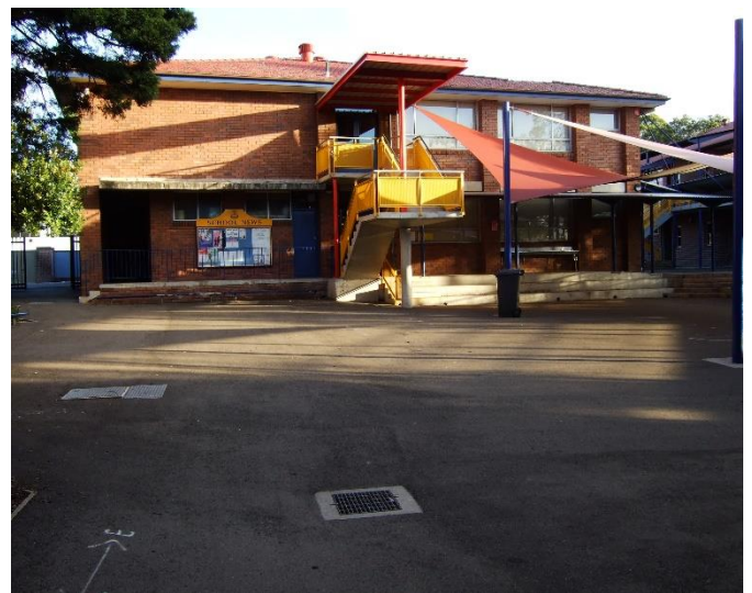
The 1972 block after the 2000-2001 renovations.