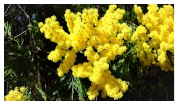
We acknowledge the Wangal people of the Eora nation as the traditional custodians of this land.