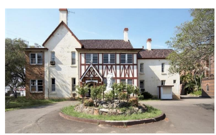
The Presbytery c 2003

The signs are located in the Church Forecourt and recall the historical parish buildings that once existed on the parish site: the first church (1845), the second church (1874), the presbytery (1882), the first school building (1894) and the convent (1898). Each sign has been placed close to the original location of that building.