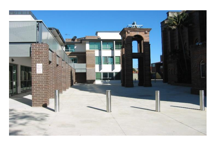
In 2008 the Presbytery, the Convent and the 1950s school building were all demolished to make way for the new St Mary's Villa.

The Presbytery continued to be the residence for the priests of the parish until 2002. As part of the strategic plan for the development of the parish site, in 2002 the residence for the parish priest was relocated to a cottage at 6 Ada Street that the parish had purchased in 1995.