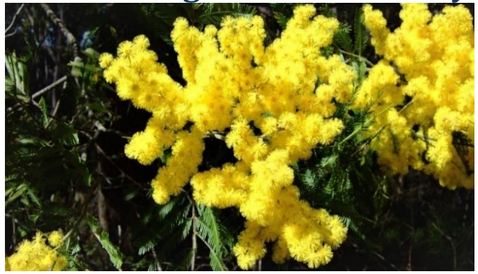
We acknowledge the Wangal people of the Eora nation as the traditional custodians of this land.

THE EASTER CANDLE: Each year the Easter Vigil begins with the entry into the darkened church of the new Paschal Candle, the symbol of Risen Christ, the Light of the world. The 2023 Paschal Candle has been made by the Benedictine nuns of Jamberoo Abbey and was generously donated to the parish by a parishioner. During the Easter Season the Paschal Candle remains near the altar. After Pentecost Sunday it is placed near the Baptism Font.