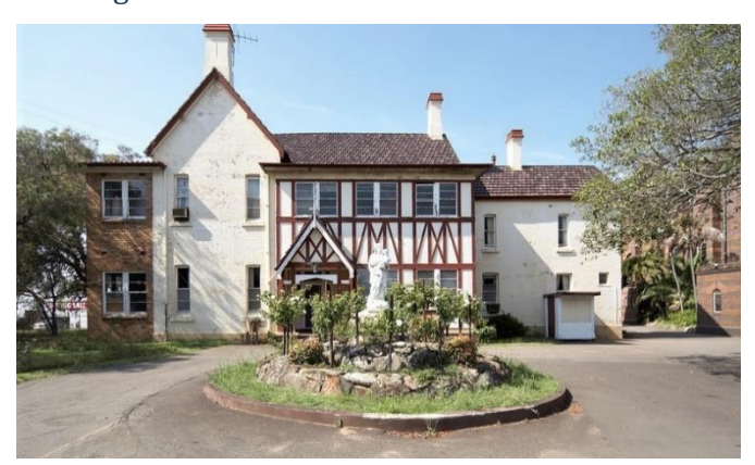
The Presbytery c 2003

The signs are located in the Church Forecourt and recall the historical parish buildings that once existed on the parish site: the first church (1845), the second church (1874), the presbytery (1882), the first school building (1894) and the convent (1898). Each sign has been placed close to the original location of that building.