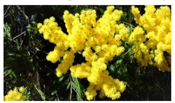
We acknowledge the Wangal people of the Eora nation as the traditional custodians of this land.

CONFIRMATION 2023 : Confirmation will be celebrated within a special Mass at 11.00 am on Sunday 4 June. Registrations will open on Monday 24 April and close on Friday 5 May. After that date please send an email to Parish Office. A registration form and an information letter will then be sent to you by return email.