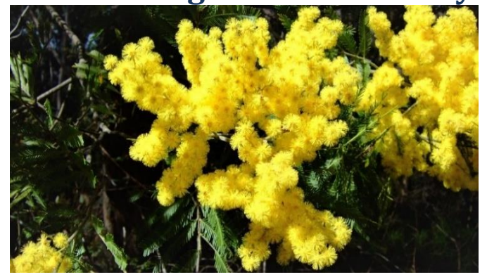
We acknowledge the Wangal people of the Eora nation as the traditional custodians of this land.

EASTER OFFERINGS Envelopes are available on the pews. Easter Offerings, together with your contributions throughout the year to the first collection, go to the support of the clergy. Your contributions not only support our parish priest here at St Mary's Concord but also assist those smaller parishes where the local community cannot support a priest. It is one of the ways that we as a community help to support struggling parishes