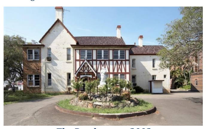
The Presbytery c 2003

The signs are located in the Church Forecourt and recall the historical parish buildings that once existed on the parish site: the first church (1845), the second church (1874), the presbytery (1882), the first school building (1894) and the convent (1898). Each sign has been placed close to the original location of that building.