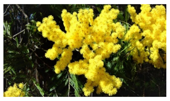
We acknowledge the Wangal people of the Eora nation as the traditional custodians of this land.