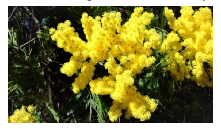
We acknowledge the Wangal people of the Eora nation as the traditional custodians of this land.