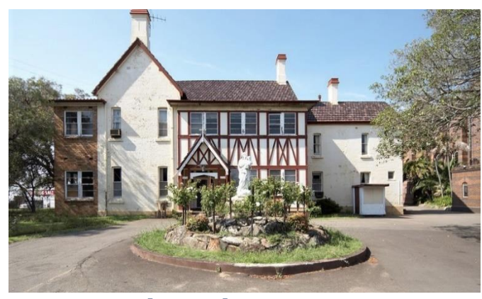
The Presbytery c 2003

The signs are located in the Church Forecourt and recall the historical parish buildings that once existed on the parish site: the first church (1845), the second church (1874), the presbytery (1882), the first school building (1894) and the convent (1898). Each sign has been placed close to the original location of that building.