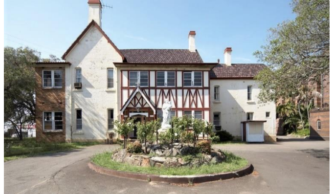
The Presbytery c 2003

The signs are located in the Church Forecourt and recall the historical parish buildings that once existed on the parish site: the first church (1845), the second church (1874), the presbytery (1882), the first school building (1894) and the convent (1898). Each sign has been placed close to the original location of that building.